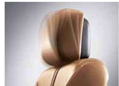
Active front headrest