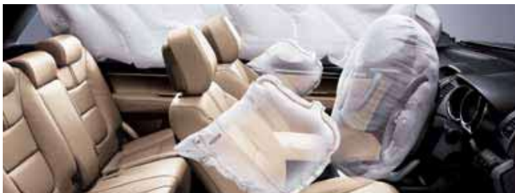
6 airbags as standard