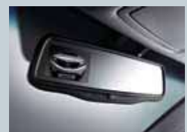
Electrochromatic rear view mirror & display