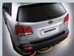
Rear parking sensors

With the help of rear parking sensors with dash display and rear view camera with in-mirror display, reverse parking is safer than ever.