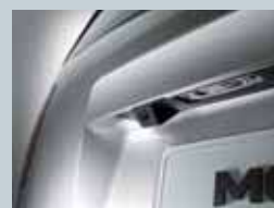
Rear view camera